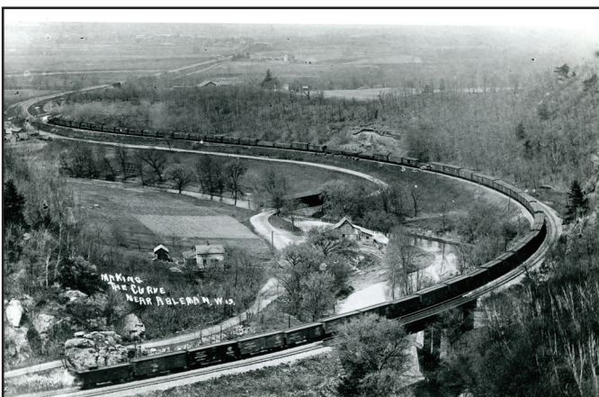
Making the Curve Near Ableman, Wis

(Contributed by Angie W. Cox Public Library)