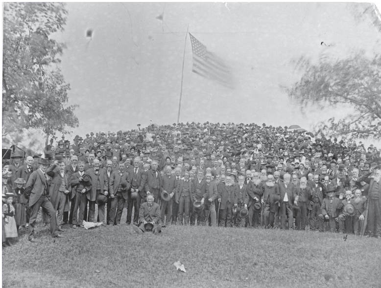
Old Settlers Grounds (Poynette, Wis)