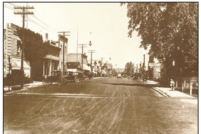
Main Street, Pardeeville, Wis

(Contributed by Angie W. Cox Public Library)