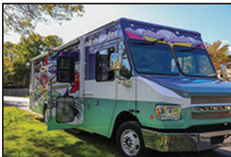
Dream Bus from the Dane County Library Service provides materials and services to community members in city neighborhoods, small towns, and rural communities.