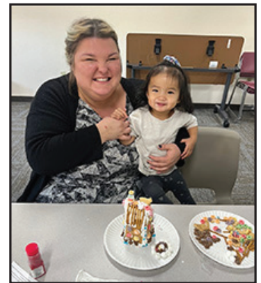
Young engineers at the Rosholt and Almond branches of the Portage County Public Library are introduced to building skills at library programs.