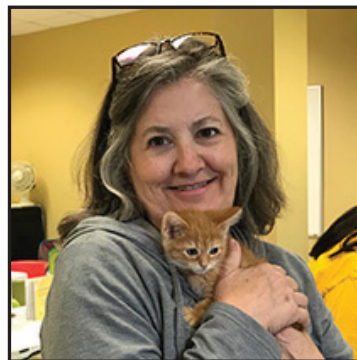
Monroe Public Library collaborates with Green County Humane Society for Cat and Dog Day 2023.