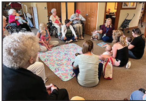
Carnegie-Schadde Memorial Public Library (Baraboo) delivers outreach programs to Oak Park Place Senior Living Community.