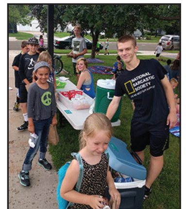
Rio Library's Summer Free Lunch program in collaboration with local schools and service agencies