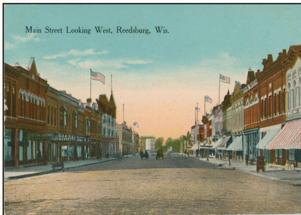
Main Street Looking West, Reedsburg, Wis.