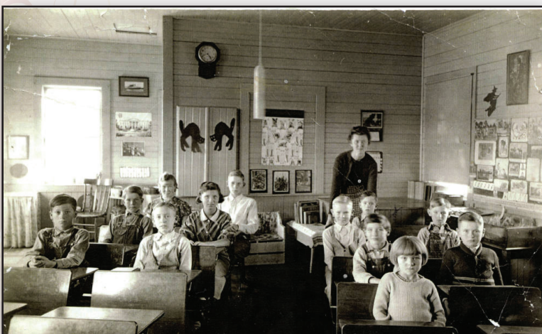
Schools of Dekorra, #5 Oshaukuta (Contributed by: Poynette Area Public Library)