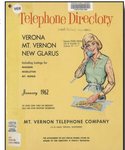
1962 Telephone Directory (Contributed by Verona Public Library)