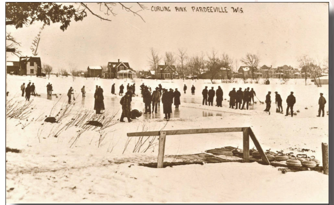
Curling Rink, Pardeeville, Wis. (Contributed by Angie W. Cox Public Library) Library

Recollection Wisconsin ( recollectionwisconsin.org ) brings together digital cultural heritage resources from Wisconsin libraries, archives, museums, and historical societies and shares them with the world in partnership with the Digital Public Library of America ( dp.la ).